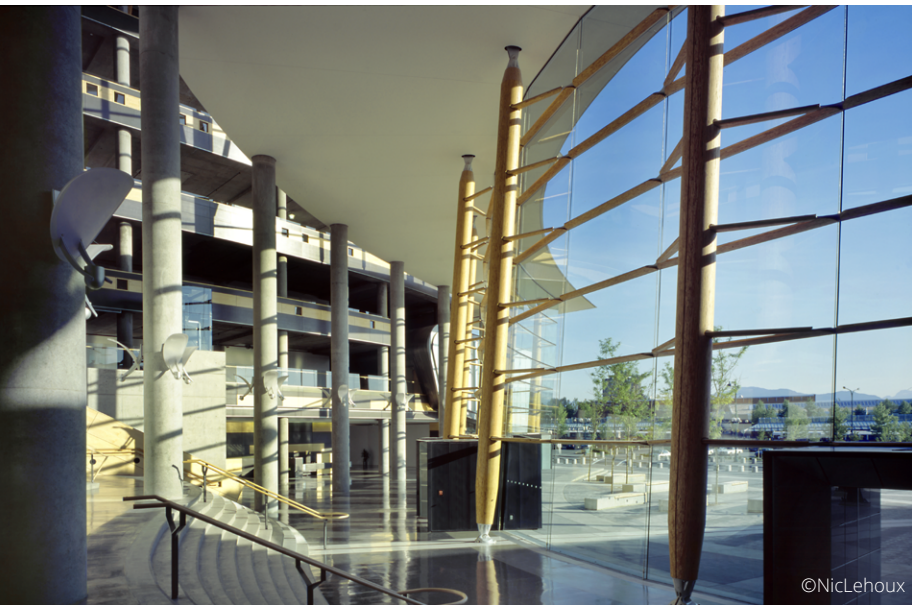
Innovation Boulevard is headquartered in Surrey's Central City, also home to SFU Surrey and Fraser Health Authority.

Innovation Boulevard believes in accelerating the growth and success of innovations that support human health. One key objective is to translate promising technologies from the research world to the private sector and enable life-saving innovations to reach broader markets. Working with world-class universities like SFU, and with the Canadian venture capital community, Innovation Boulevard is pioneering a technology transfer program to attract business executives from around the world to lead new companies based in British Columbia. Our technology transfer program transitions high-value innovations from academia into the hands entrepreneurs and Canadian small businesses to fast-track commercial development of sustainable, world-class businesses.